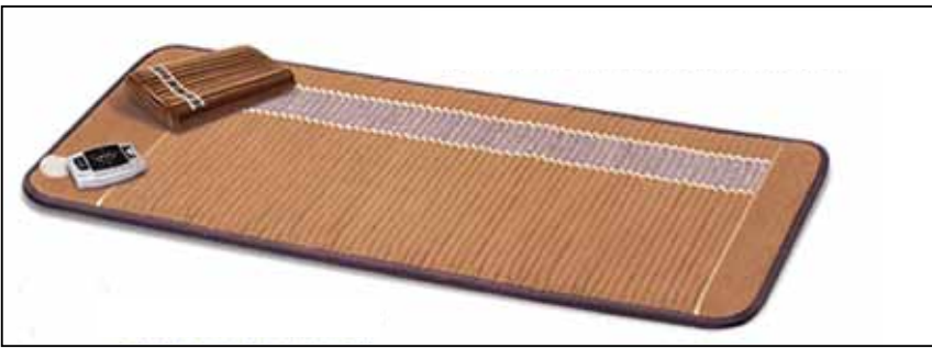
Figure 2 The amethyst BioMat and the Time/Temp control

as revealed in the ICAP brain scan and heart scan, as well as a reduction in cortisol levels.